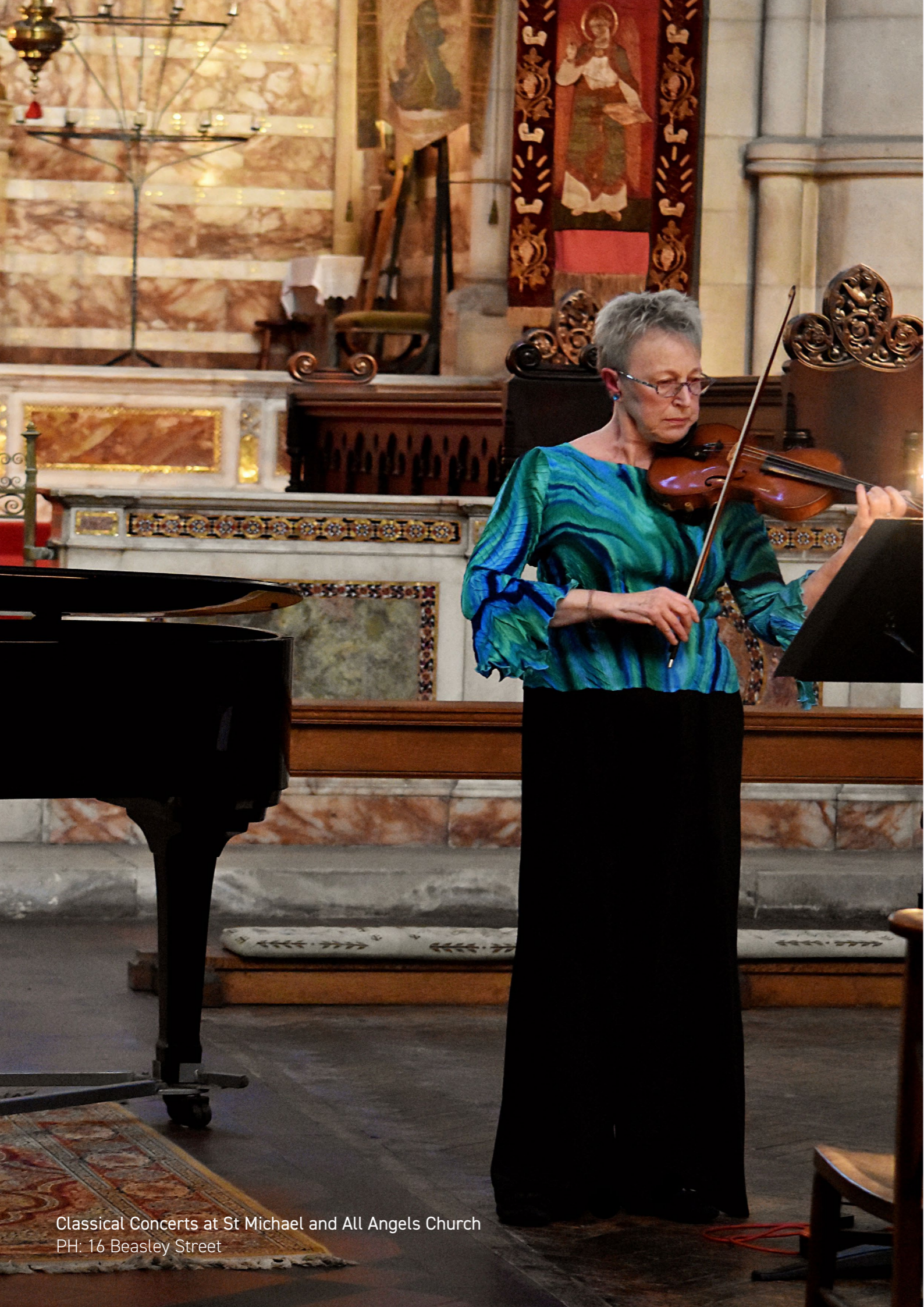
Classical Concerts at St Michael and All Angels Church PH: 16 Beasley Street