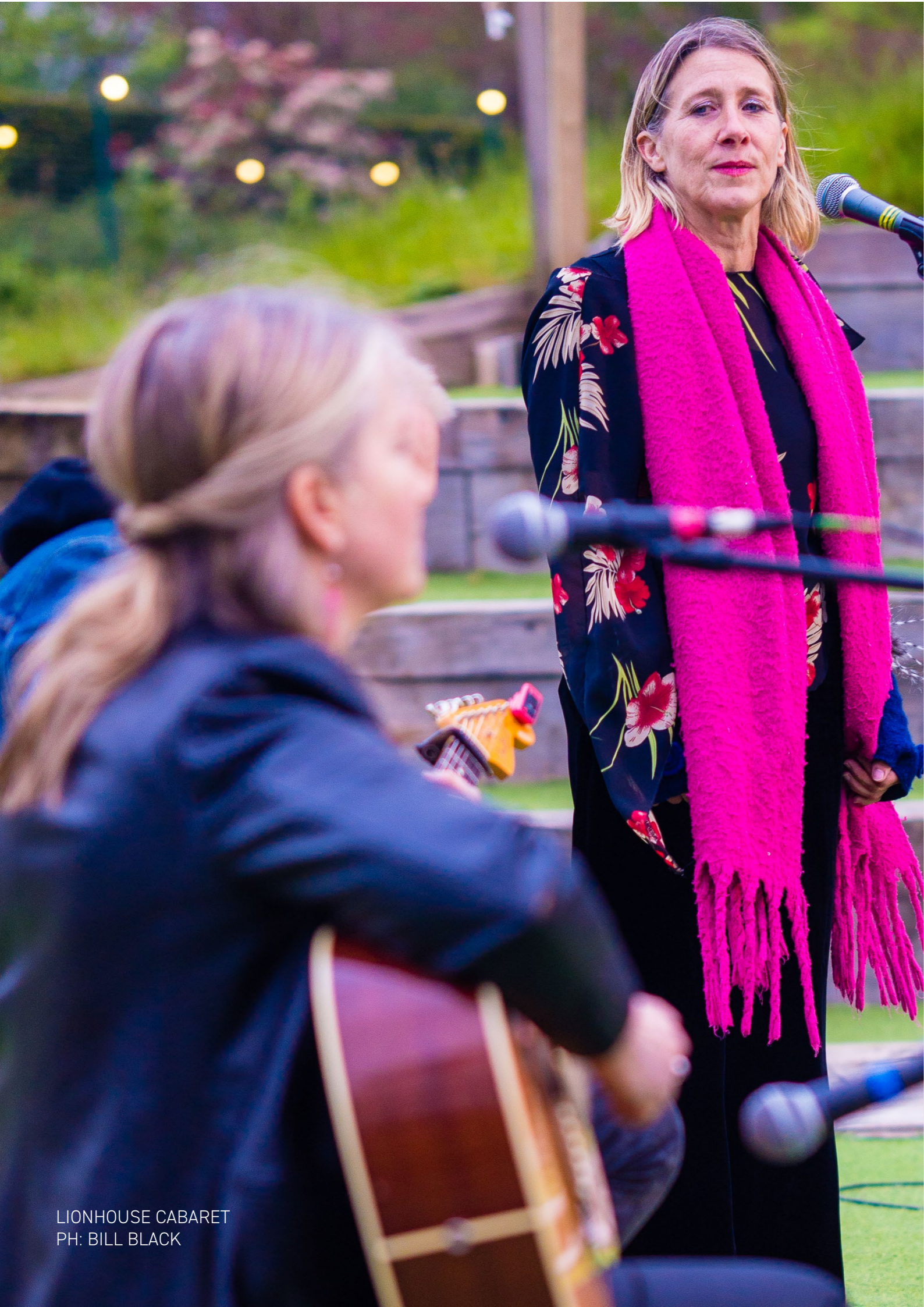
LIONHOUSE CABARET